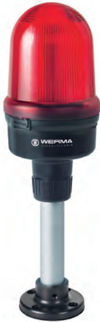
Tube Mounting (tube and base for tube - accessory)